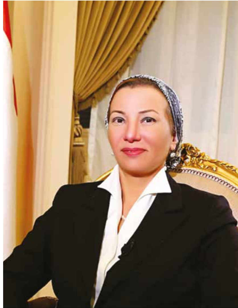
MINISTER OF ENVIRONMENT, H.E. DR. YASMINE FOUAD

Therefore, a recent decision was taken to prepare the first comprehensive national climate change strategy – 2050, which lays down the directions and policies to be adopted by the country to fulfil its aspirations for its climate action. The strategy includes five main goals (a) achieving sustainable economic growth and low-emission development in various sectors, (b) enhancing adaptive capacity and resilience to climate change, and alleviating the associated negative impacts, (c) enhancing climate change action governance, (d) enhancing climate financing infrastructure, and (e) enhancing scientific research, technology transfer, knowledge management and awareness to combat climate change.